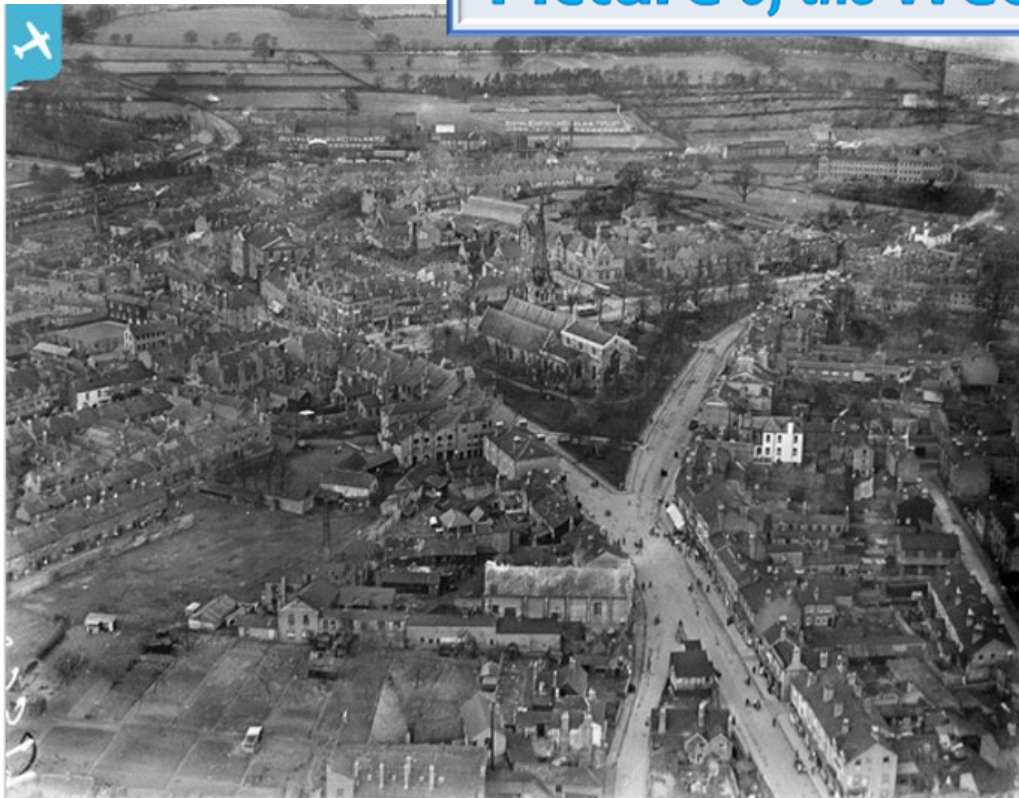
St Stephen's Church and the town centre, Redditch, 1921